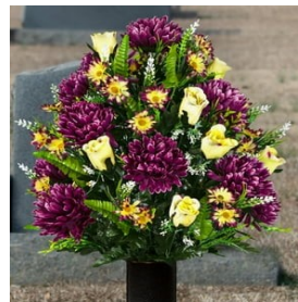
PKG - CARED