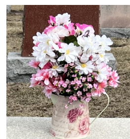
PKG - FORGET ME NOT

Daisy Clarkia Carnations Alyssum Azalea Chrysanthemum Poppy Aster Roses