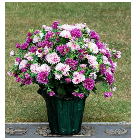
PKG - DELIGHTFUL