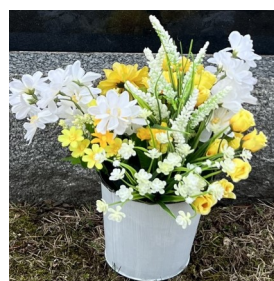
PKG - EVERLASTING