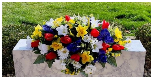
PKG - FOREVER YOUNG