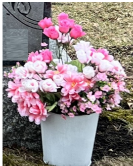
PKG - BEYOND